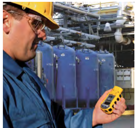
Worker exposure monitoring with ToxiRAE Pro PID at a PVC plant